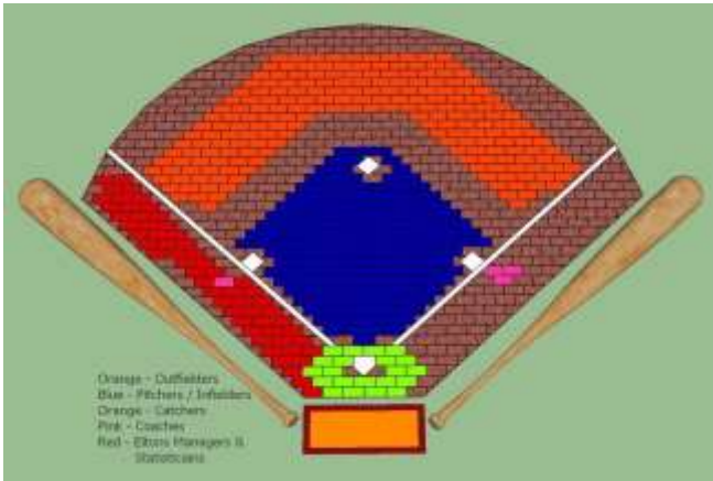
The Elton Goodwin monument